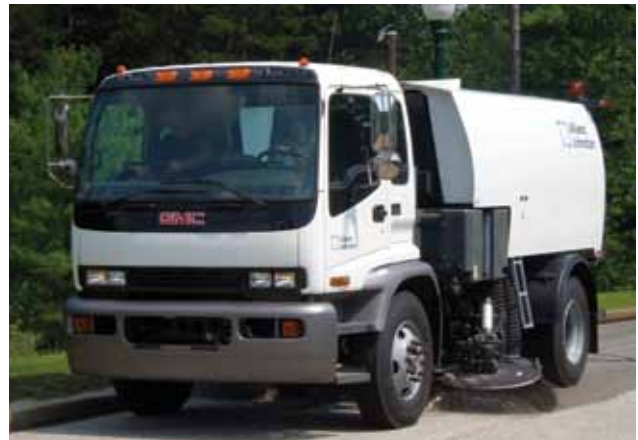
RT655 Regenerative Sweeper

Allows for sweeping in reverse without worrying about damaging the sweep gear.