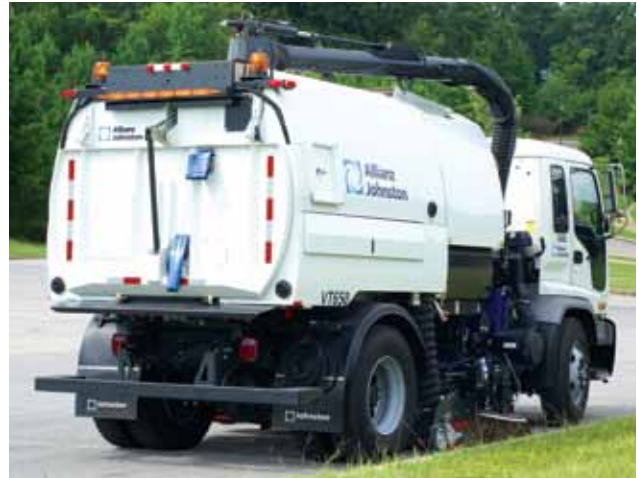
VT 650/800 Vacuum Sweeper

In-cab control panel features small easy to use controls.