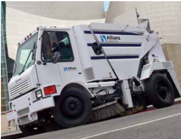
4000 Mechanical Sweeper

The Allianz 4000 is a high performance sweeper that offers unmatched reliability, safety and ease of use.