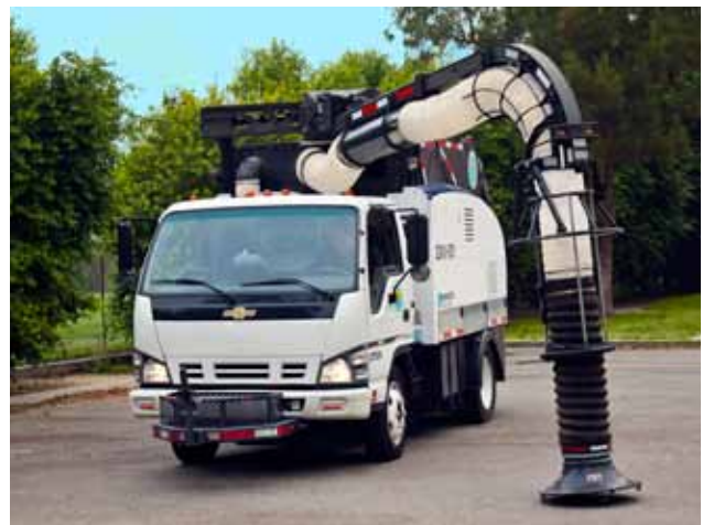
LT500 Litter Collection System

In-cab controlled robotic vacuum arm with 12" hose.