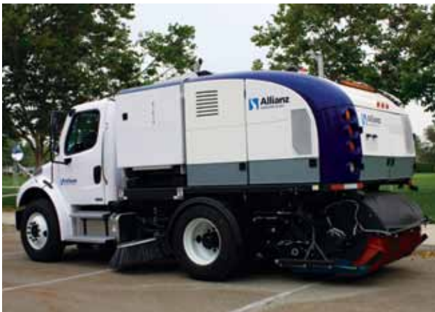
MS/MT350 Mechanical Sweeper

CNG Alternative fuel option for reduced emissions.