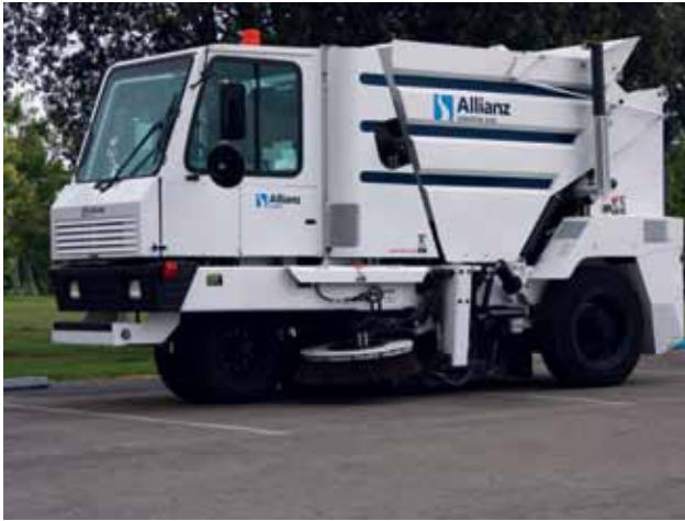
3000/MX Mechanical Sweeper

The Allianz 3000/MX three-wheel sweeper sets the standard for street sweeper equipment.