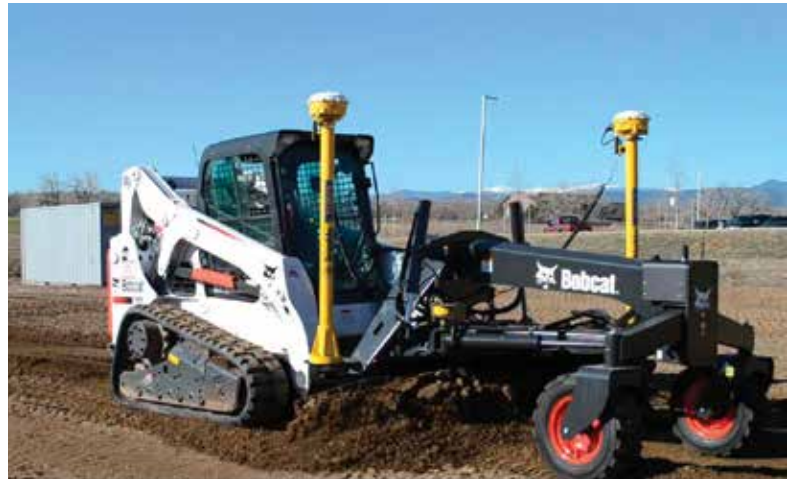
Bobcat with HD Grader Attachment and Trimble GCS900 Grade Control System with Dual GNSS