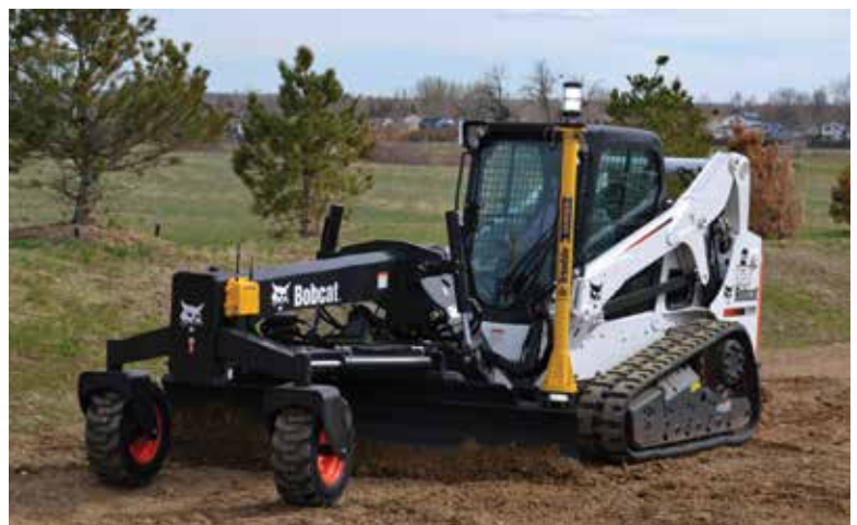
Bobcat with HD Grader Attachment and Trimble GCS900 Grade Control System with Universal Total Station