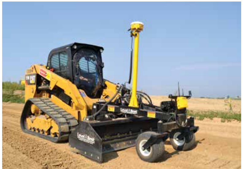
ATI Level Best PD Series Grading Box and Trimble GCS900 Grade Control System with Single GNSS